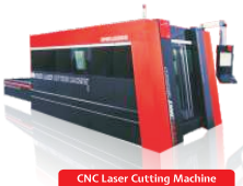
CNC Laser Cutting Machine

We provide the best delivery schedules for fabrication of assemblies and Product Development using facilities like Demmeler Modular Fixtures and Multi-Axis Welding Robot (Simplicity)