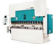
CNC Bending Machine